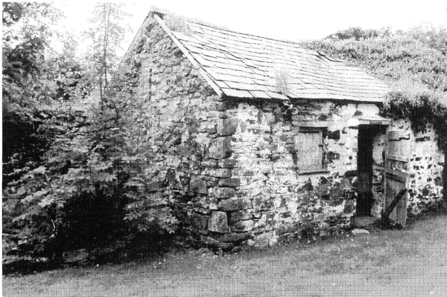
Figure 1 Winter bee house [IBRA Register no. 1283] with 17 recesses; near Narberth, Pembrokeshire, Wales.