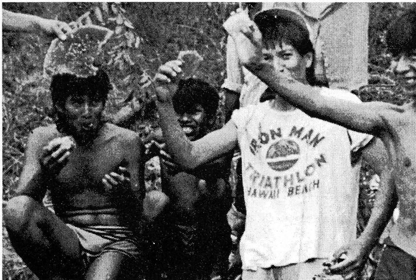
Figure 2. Group of Toha eating combs taken from the nest in Figure 1.

1940). In South America Father Antonio Ruiz de Montoya (1639) reported that Asunción, especially, supplied the inhabitants of Paraguay with honey among other commodities; no one knew how to domesticate the bees, but they bred very well in the mountains. The people on Margarita Island off the north coast of Venezuela sold and bartered honey among other foods.