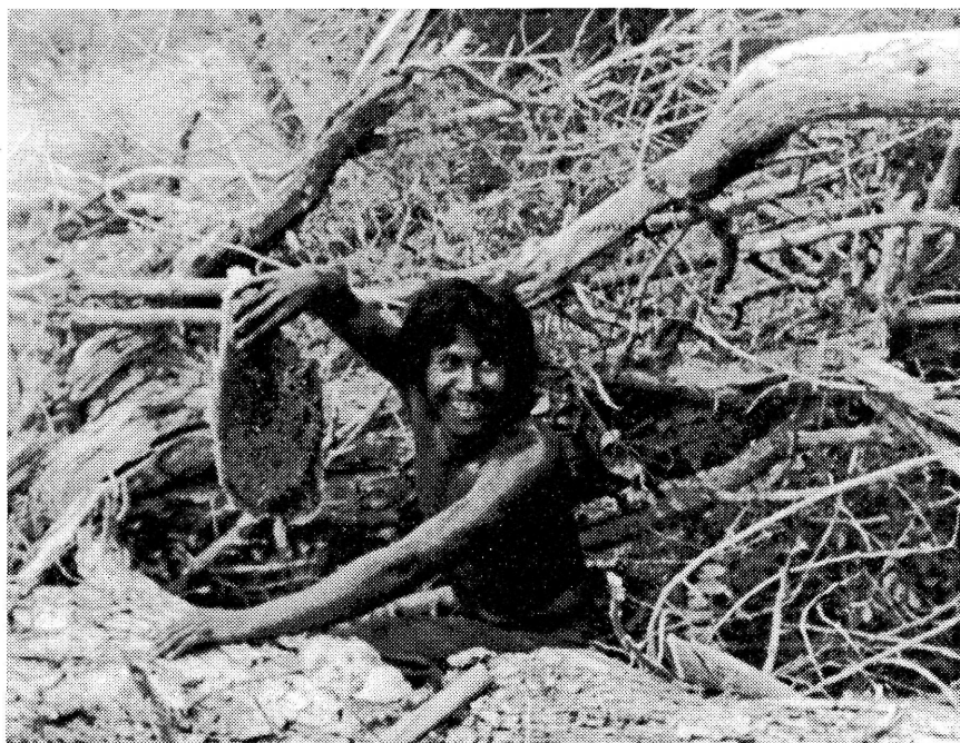
Figure 1. A Toha man holding up a honey comb from a honey bee nest in north-east Argentina, 1989.

Schwarz's book Stingless Bees of the Western Hemisphere (1948) contains many details about Amerindian usage of bee products on pages 123-166, and is referred to a number of times in this paper.