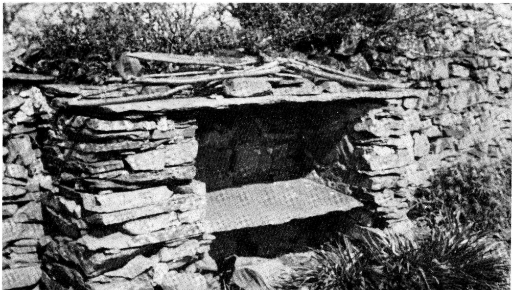
PLATE 1. Typical small Cumbrian bee shelter with drystone end walls and slate roof and shelf, at Heathwaite, Grizebeck [IBRA Register no. 210]. Photographer unknown, c. 1953.

A more substantial form of protection was a bee shelter , usually an open-fronted roofed structure (Plate 1) fitted with one or more shelves on which skeps were placed. Bee shelters were built against a wall, or were sometimes free-standing. They were probably the most usual type of structure specially built for housing bees in many parts of Europe. Whereas skeps from past centuries have disintegrated long ago, some stone bee shelters