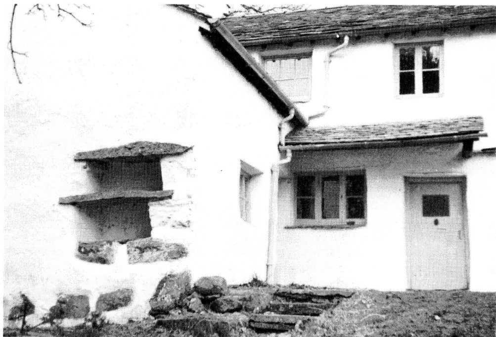
PLATE 6. Two bee boles, each for two skeps, in a south-facing house wall, Raw Head, Great Langdale [636].