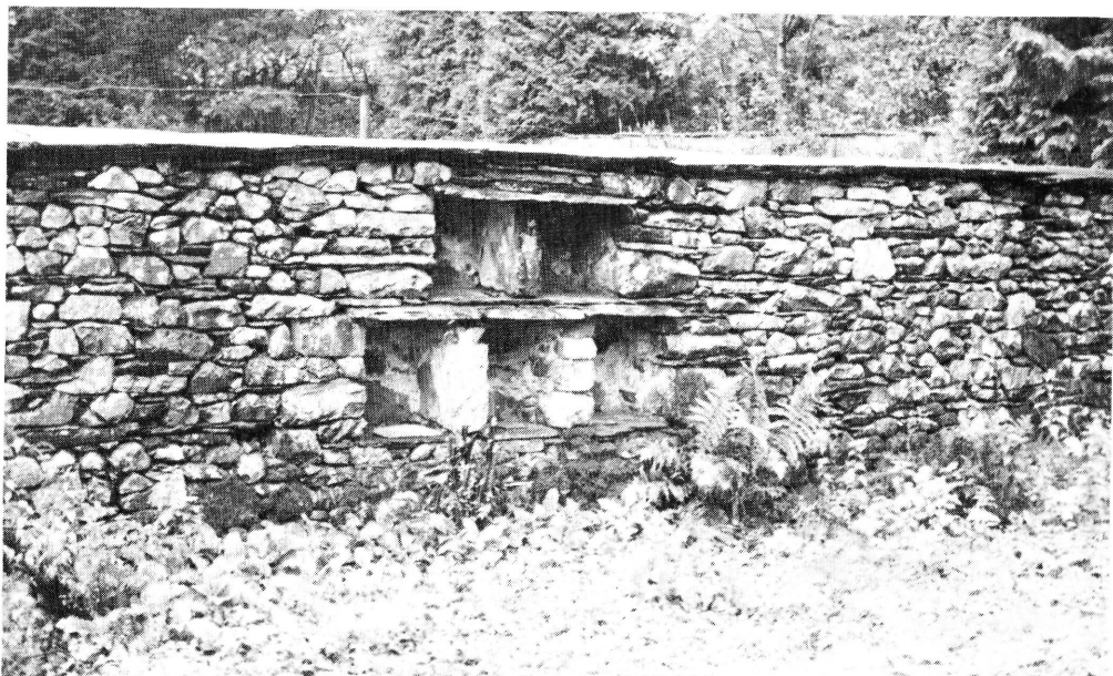
PLATE 5. Five bee boles in two tiers, with projecting lintel stones, Thurston, Coniston [636]. Photo B. Tyson, 1981.

The back wall of a bee bole is usually flat, but may be rounded. One of the five sets in