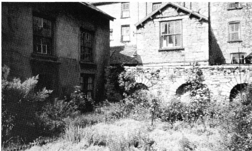
PLATE 7. Three alcoves in a garden, yard 43, Highgate, Kendal [670], photographed before the site became Booth's car park. Photo Mr Morton, 1963 (The Margaret Duff Collection).

to attend to the skeps. Usually the wall was solid, and openings were provided through which the bees flew out. Altogether thirty-two bee houses are known to have survived in Britain and Ireland, and two of them are in Cumbria, together with one built about 1960 for modern hives [842].