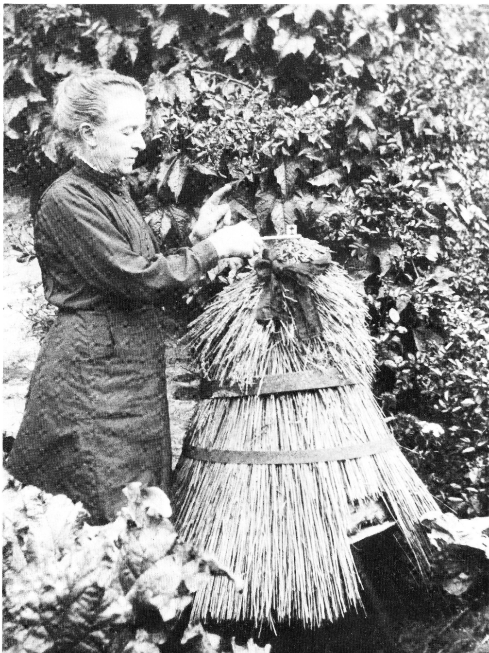
PLATE 8. A widow 'telling the bees' of her husband's death, having tapped the side of the hive with the key. Black crepe is already in position on the hackle protecting the skep.