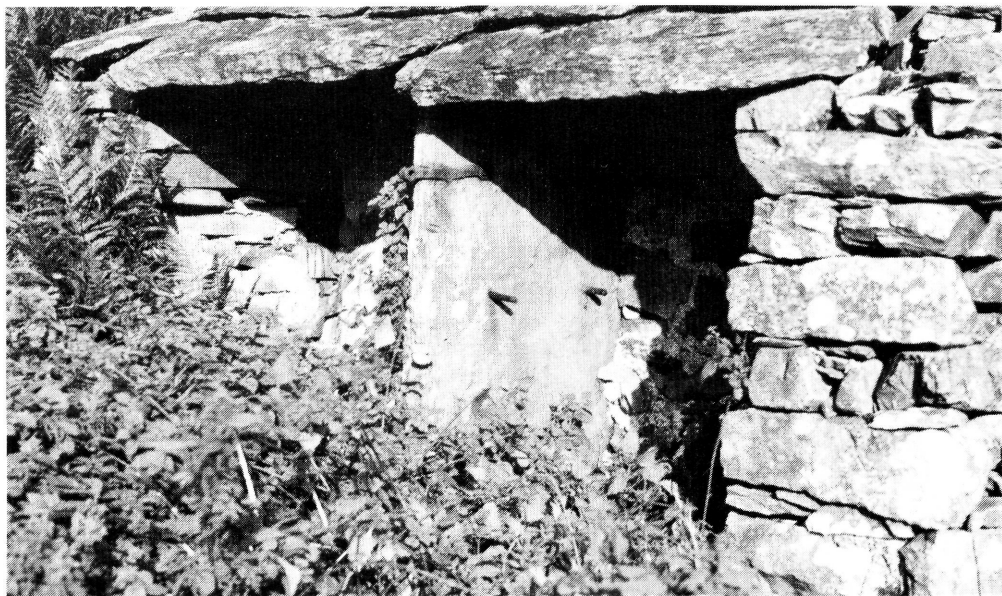
PLATE 3. Bee shelter with two compartments, at Light Hall, Rusland [632a]. On the upright dividing stone, the metal pegs held a shelf, and the metal fixture at the top was for a door. Photo P. Walker, 1990.

joists, and the tiles in some roofs are held with wooden pegs. A reporter described the roof on the shelter at Sykeside, Grasmere [513b] Plate 4, as ‘Westmorland wrestler slates, notched and “clicked” together’. Occasionally, for example at Fellside, Kendal [671], the roof consists of one large slab of slate, and the shelter in Plate 1 has single slabs of slate for its roof and shelf.