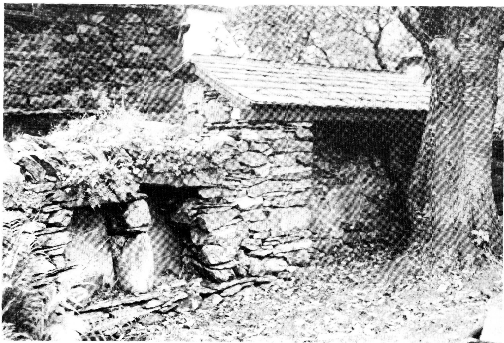
PLATE 4. Two bee boles and a bee shelter at Sykeside, Grasmere [513]. Photo P. Walker, 1990.

may each be 1–2 feet thick. Their internal depth from front to back ranges from 17 inches to 48 inches (average 29 inches).