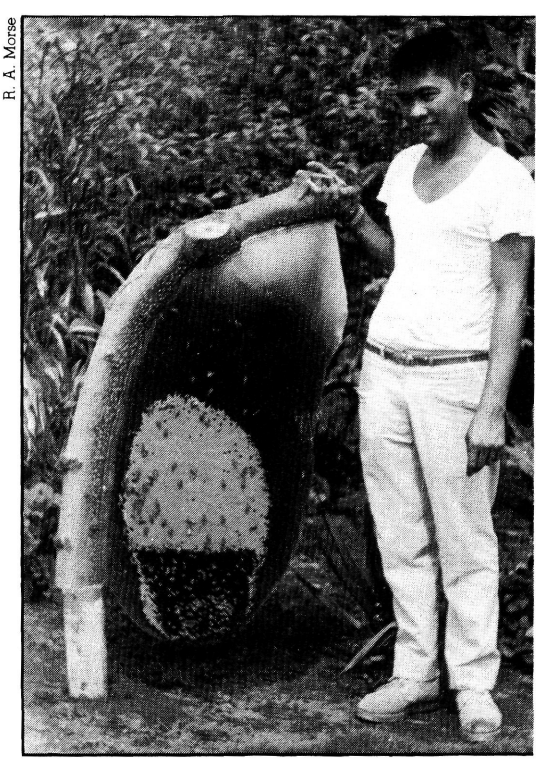
Apis dorsata comb from a tree in the Philippines. The branch has been cut off and the bees removed to show the unusually compact brood nest.

Apiculture or beekeeping has a great potential for expansion and improvement in the tropics and subtropics, whereas in the temperate zones it is already much more fully exploited. At the simplest level beekeeping can provide peasant farmers with extra food and cash. As a large organized industry in subtropical countries, notably China, Mexico and Argentina, it already provides the bulk of the honey exports on to the world market. There are many stages between these two extremes, and beekeeping can be fitted in with other work, since bees need rather little attention. In different countries the management of bees is similar in principle, but differs in important details, and it is vital to have knowledge about what is needed, if the best returns are to be achieved.